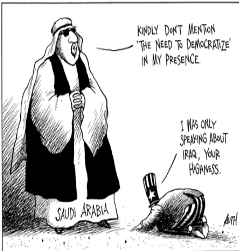
Document 4: A political cartoon from the Philadelphia Inquirer

8/29/02 THE PHILADELPHIA INQUIRER. UNIVERSAL PRESS SYNDICATE.